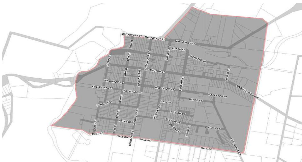
Figure 1 Merriwa Heritage Conservation Area

The planning proposal refers to the Merriwa Conservation Area that applies to the urban land of the town of Merriwa. The heritage conservation area is bounded by Macartney Street/ Scone Road to the north, an unnamed Crown Road to the east, Hall Road to the south and the Merriwa River to the west. The conservation area encompasses a wide range of buildings and architectural forms representing different periods of Merriwa's development from the late 1820's to the present day.