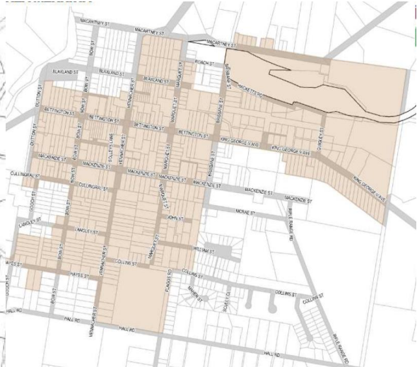
Figure 3 Current Heritage Conservation Area